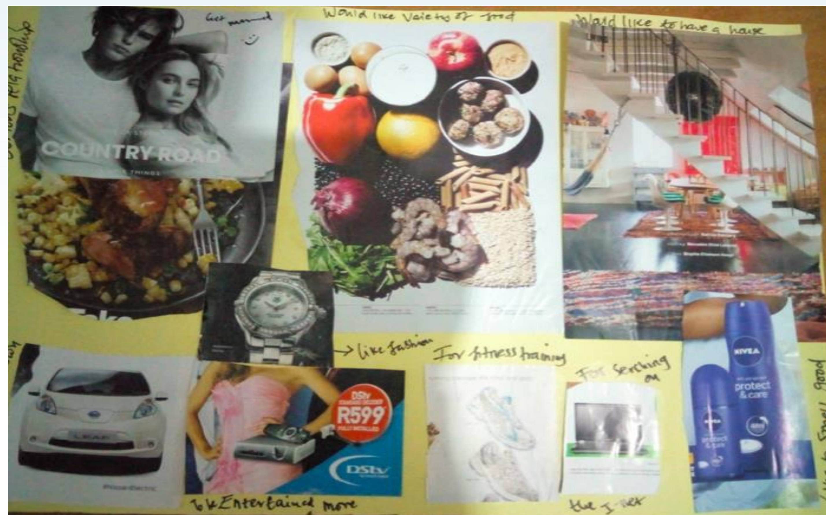
Figure 1. Collage created by YPLWH showing a description of themselves. This collage reflects a young man's future aspirations (marriage, cars, a nice house); maintaining health through good diet, personal hygiene and running; keeping time; and accessing the internet.